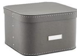
Oskar Storage Boxes