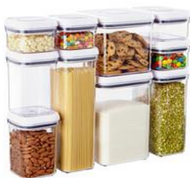
OXO Good Grips 10-Piece

I love organizing kitchens and pantries. I get to be creative with so many versatile products. These are some of my favorite go to items, They all have great form, function and design.