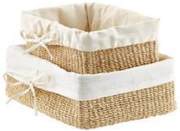
Natural Mikati Baskets

There is nothing better than opening a linen closet that looks fresh and clean. One way I achieve this look is to use baskets and containers that play off of a white and natural color scheme.