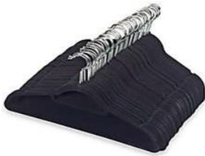
Real Simple Slimline Hangers

There are so many creative ways to take advantage of all the space in your closet. I use slim hangers, shelf dividers, shoe racks, hooks, and double rod expanders to maximize every inch. These space saving products look amazing and will give your closet the WOW factor.