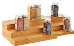
3-Tier Expandable Spice Rack