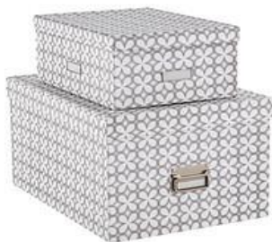
Bigso Storage Boxes