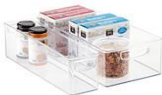
InterDesign Deep Drawer Bins