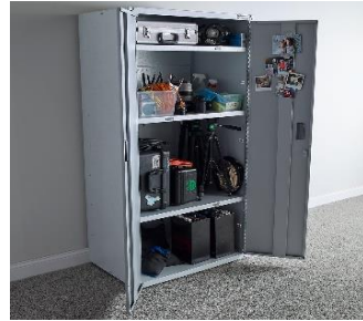
Gladiator Large Gear Cabinet