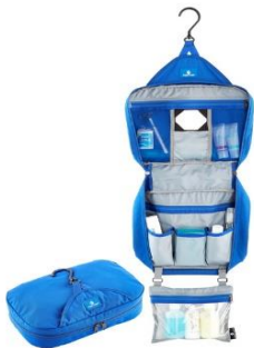
Eagle Creek Wallaby Organizer