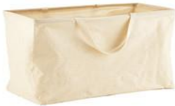
Umbra Natural Crunch Basket