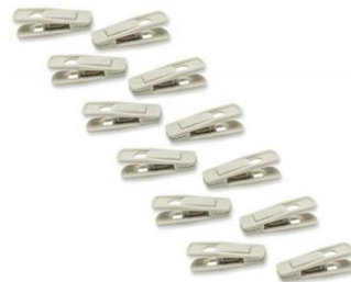
Real Simple Hanger Clips