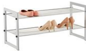
2-Tier Stackable Mesh Shoe Rack