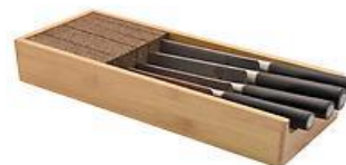
Bamboo Knife Dock