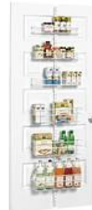
Elfa Utility Pantry Door & Wall Rack