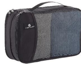
Eagle Creek 2-Side Clean & Dirty Cube