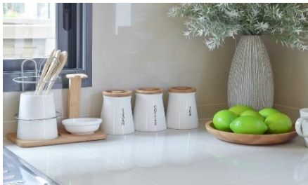
Kitchen & Pantry

I am happy to share my favorite products with you. I use all of these products regularly on my projects. They became my favorites because of their durability, design and function. And my clients love them too!