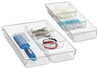
InterDesign Linus Section Trays