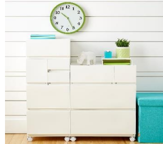
Modular Stackable Drawers