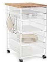
Elfa Mesh Kitchen Cart