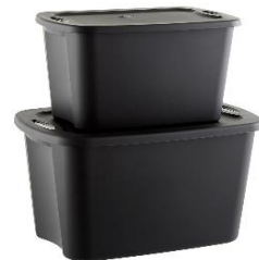
Sterilite Tote Boxes