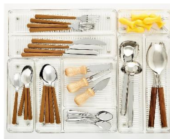
InterDesign Linus Shallow