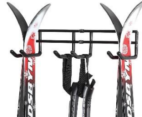
Double Ski Hanger