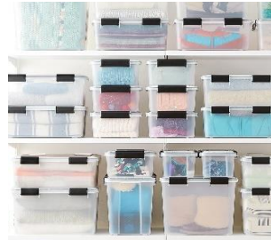
Clear Weathertight Totes