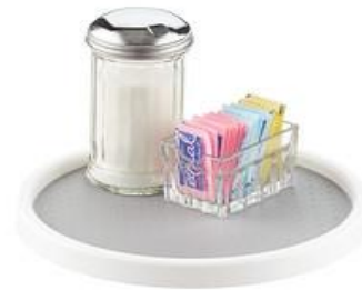
Madesmart Lazy Susan