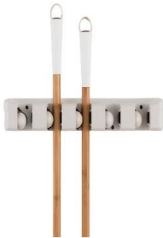
Handled Tool Holder