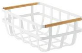
Tosca Basket with Wood Handles