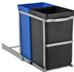
simplehuman 2-Bin Pull Out Recycle Bin