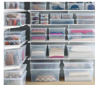
Clear Storage Boxes