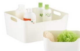
White Plastic Storage Bins with Handles