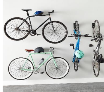
Folding Bike Hanger