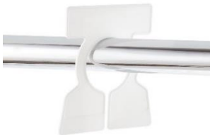
Simple Division Rod Dividers