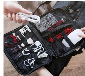
Tech Cord Organizer Pocket