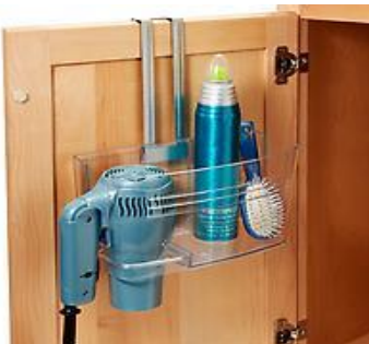
Umbra Under Sink Caddy