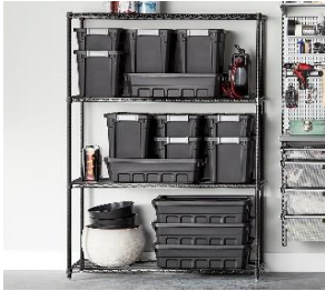
InterMetro Shelving Units

The key to an organized garage is maximizing both your floor and wall space. My go to products for capturing both are shelving units and cabinets. I also take full advantage of the wide assortment of organizing products for tools and sporting equipment. I guarantee they will keep your garage nice and tidy.