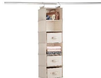
6 Compartment Hanging Sweater Organizer