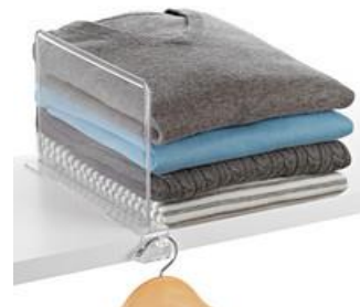
Clear Shelf Dividers