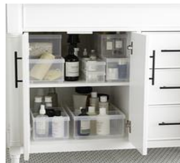
Clear Stackable Storage Bins