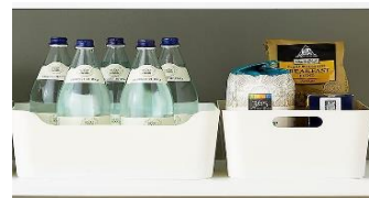
White Plastic Storage Bins with Handles