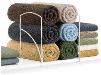
Lynk Tall Shelf Dividers