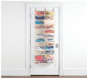
Over the Door Shoe Organizer