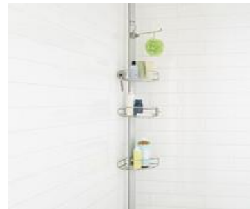
simplehuman Tension Pole Shower Caddy