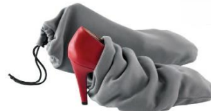
Shoe-ins Travel Shoe Bags