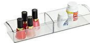
InterDesign Linus Cabinet Organizers