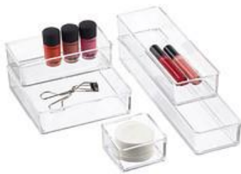
Acrylic Stackable Drawer Organizers

Most bathrooms have limited storage space. I use the backs of doors and I take advantage of the height in the under-sink cabinets. These products are masterful at maximizing space and utility.