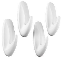
3M Large Command Hooks