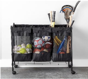
Heavy-Duty Triple Storage Bin