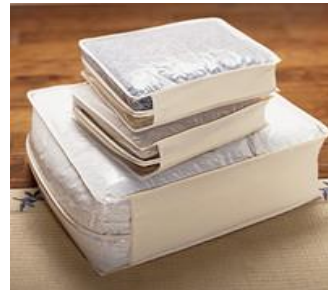
Natural Cotton / PEVA Storage Bags