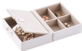
Stackers Folding Travel Tray