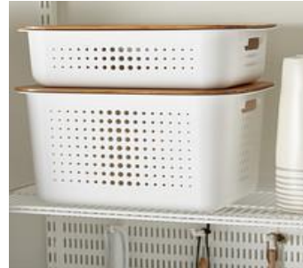
White Nordic Storage Baskets