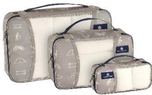
Eagle Creek Packing Cubes

Travel cubes are a game changer in packing. I am addicted to them. They come in multiple shapes and sizes to keep all your belongings organized and wrinkle free. They also keep dirty clothes separate from clean. Best of all, just place your cubes in the drawer and you are done unpacking.