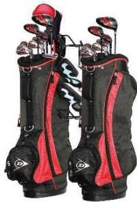
Double Golf Bag Holder