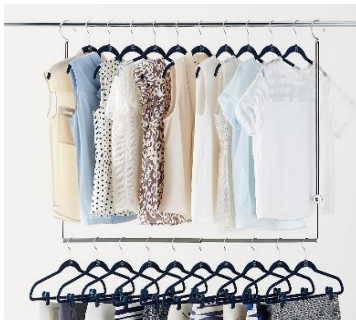
Umbra Closet Rod Expander